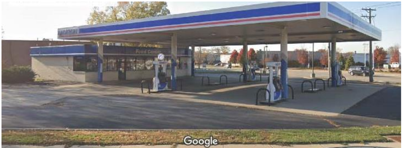
The existing Marathon Gas station and convenience food store at 500 S. McLean Boulevard

If the conditional use is granted, the applicant must also apply for and obtain a liquor license prior to any liquor sales. The applicant is not proposing any exterior changes to the building or the site.