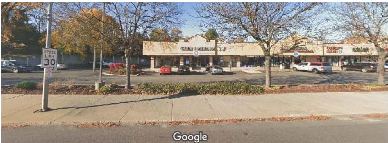
The location of the proposed tobacco store at 20 S. State Street

The applicant is not proposing any exterior changes to the building or the site. Minor interior improvements are proposed to accommodate the new use. The tobacco store would sell tobacco and vape products, and would be open from 10 am to 11 pm Monday through Sunday.