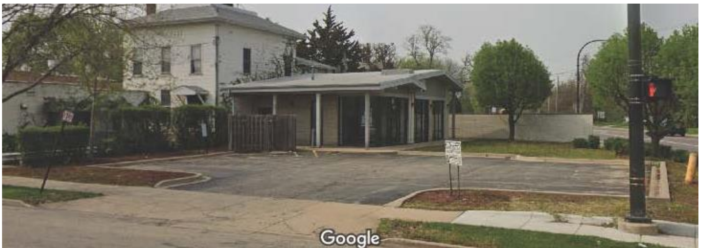
The existing building at 268 S. State St, the location of the proposed liquor store

The proposed liquor store would be open from 9 am to 11 pm Monday to Thursday, 9 am to 12 am Friday and Saturday, and 10 am to 10 pm on Sunday. If the zoning approval is granted, the applicant would have to apply for and obtain a liquor license prior to the start of operation.